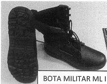
BOTA MILITAR ML I

2) insert description of the object of declaration (please either include photos and the description of the product 请插入你们的产品图片和写上你们的产品描述)